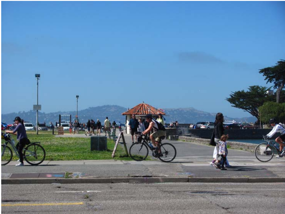
Marina Green Kiosk