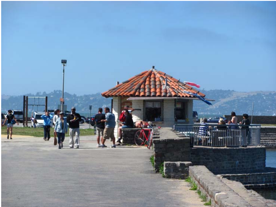
Marina Green Kiosk