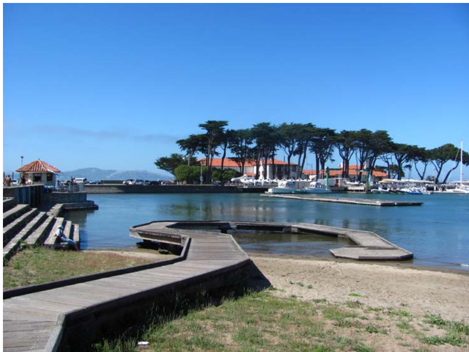
View of the St. Francis Yacht Club, Marina Harbor, beach and Marina Green Kiosk from Marina Boulevard.