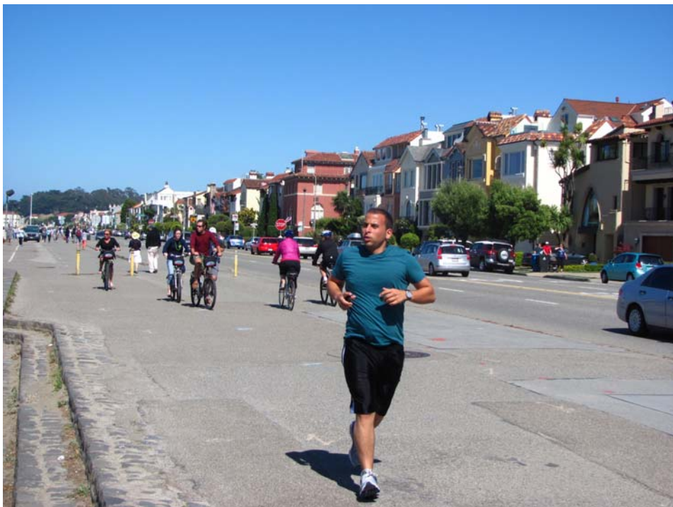
View of Marina Boulevard at Baker Street adjacent to the Marina Green Kiosk