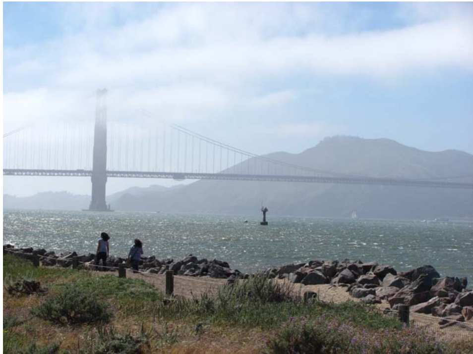
View of Golden Gate Bridge from the Kiosk Area