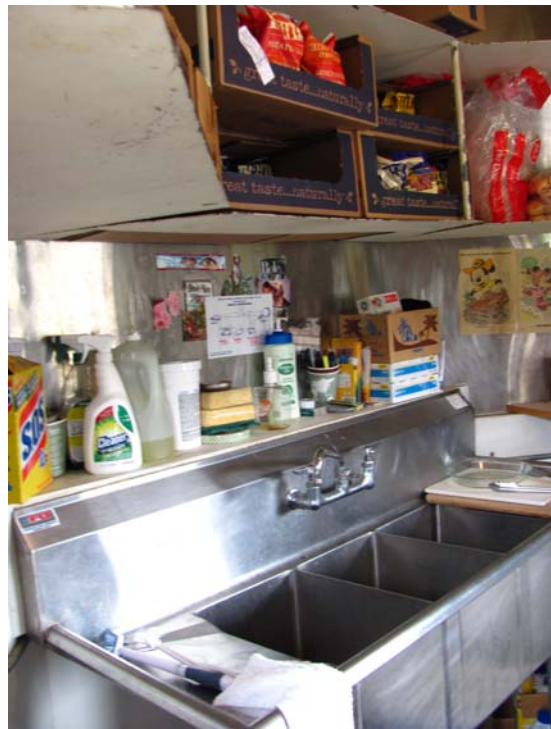
Photos of the Interior of the Kiosk