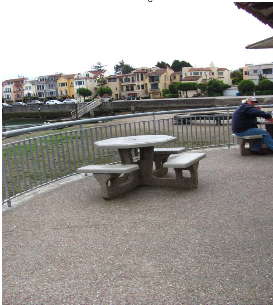
Photo of Kiosk Plaza