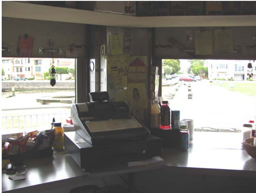
Photo from inside the Kiosk looking out through the operable service windows.