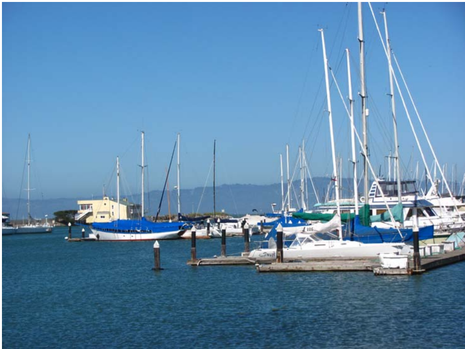
View of the Marina Harbor from the Marina Green Kiosk