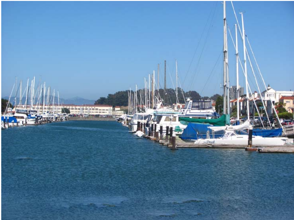
View of the Marina Harbor and Fort Mason from the Marina Green Kiosk