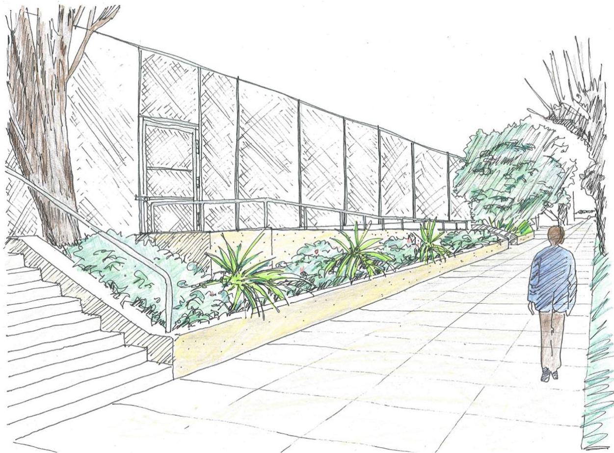
Artist's illustration of new ramp on 30 th Ave