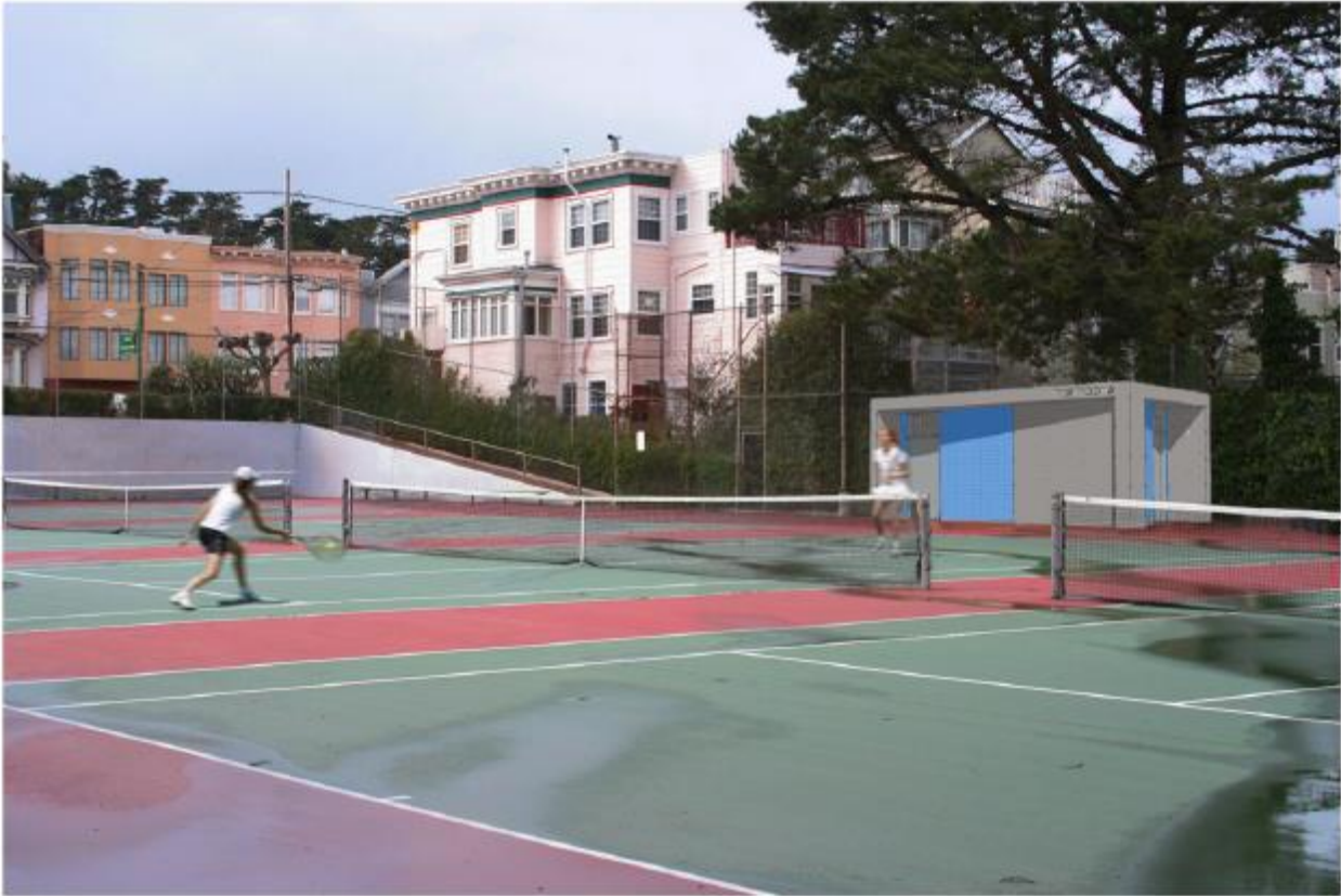
Photo montage of new restroom at Dupont Courts